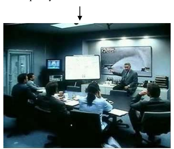
Figure 6. Insider copied movie - note the boom microphone in top centre (after [1])

Out of the 285 movies, 77% met the above criteria and were assumed to be insider copies. Only 7 movies appeared before the cinema release and 5% appeared after the DVD release.