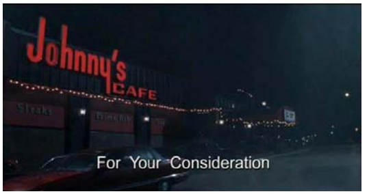
Figure 4. Award Consideration Copy (after [1])

Outsiders can make their own copies by taking a camcorder into the cinema, copying a hired or purchased DVD or VHS, or recording from television.