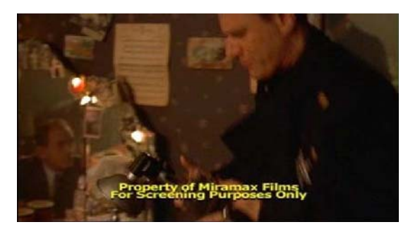
Figure 2. Screener copy (after[1])