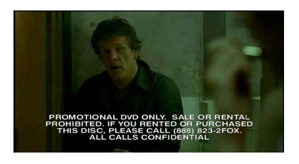
Figure 3. Promotional Copy (after [1])